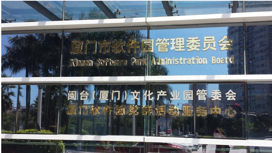
(1) Visiting Xiamen Software Park Administration Board