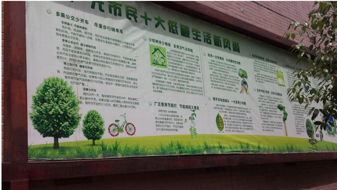
(1) Low-carbon life initiative poster