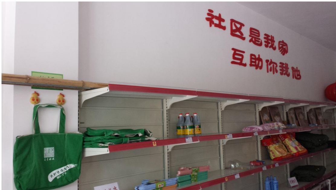
(2) Low-carbon and harmonious community