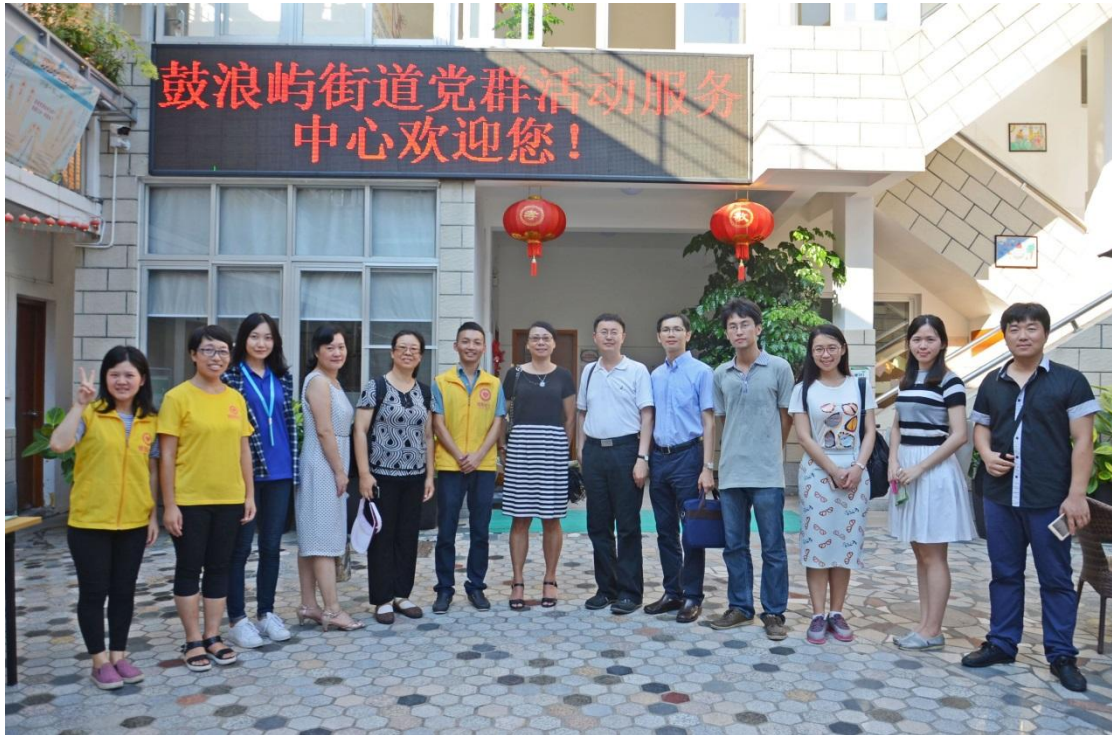
(5) Visiting Luhui Residential Community in Gulangyu Island. Younger in yellow T-shirt are environmental protection volunteers