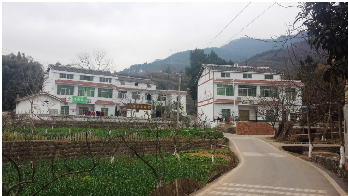
(6) New style rural community