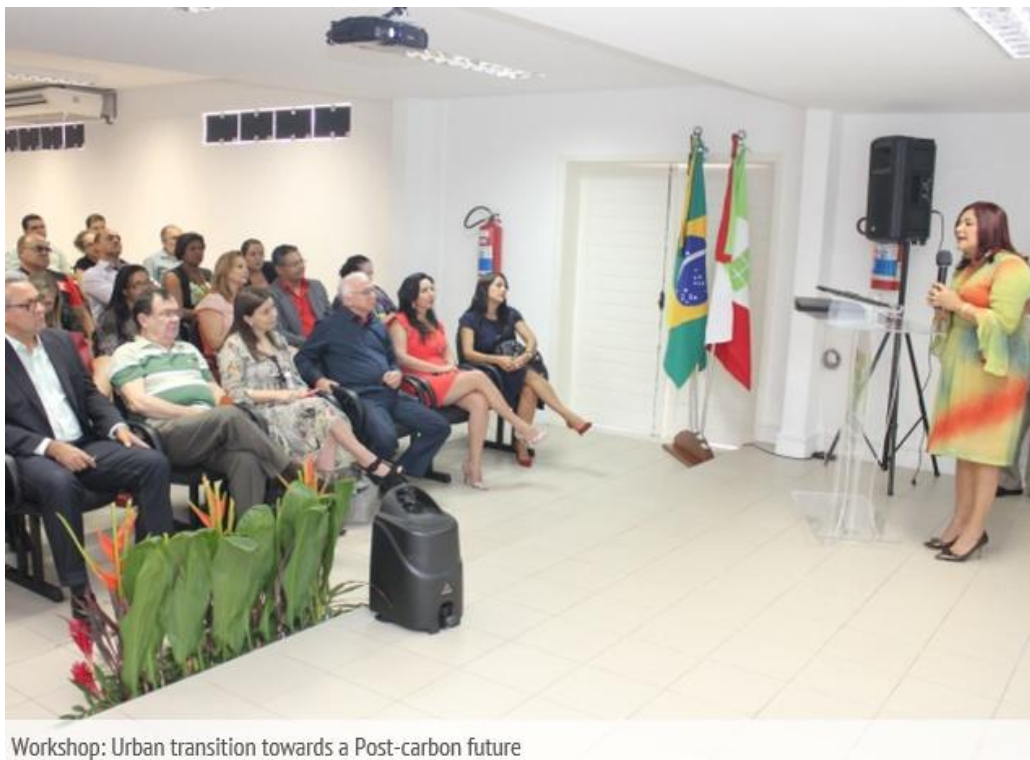
Workshop: Urban transition towards a Post-carbon future

Finally future collaboration opportunities in the area of post-carbon cities were explored.