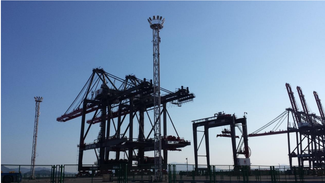
(3) Visiting Xiamen Port for low-carbon port construction