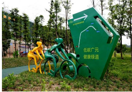
(4) Public bicycle service and green lane