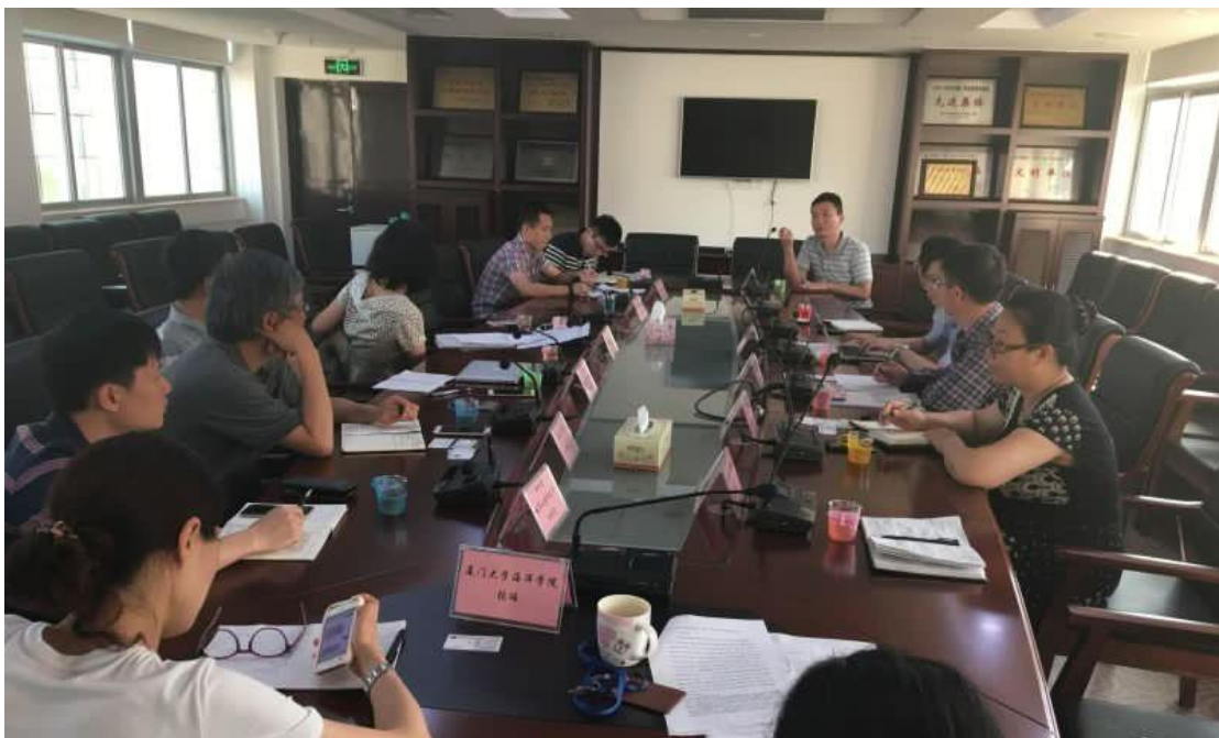
(7) Meeting with energy conservation and low-carbon development experts