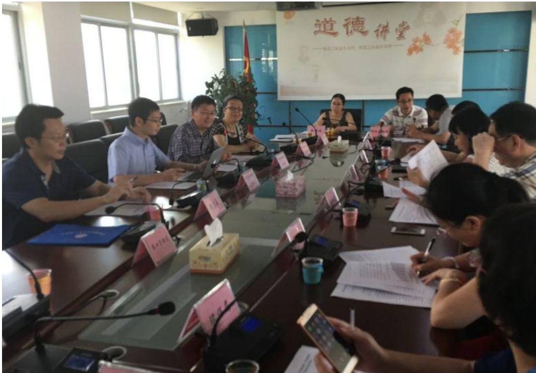
(6) Meeting with Xiamen Municipal officials

(6) Public bicycle service. Users can easily check the map of public bicycle stations and bicycle available.