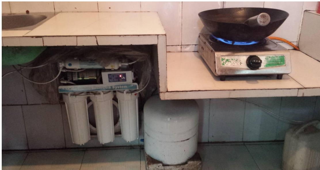
(5) Biogas utilization in rural area