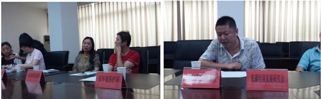
(3) Meeting with GY Municipal officials and experts