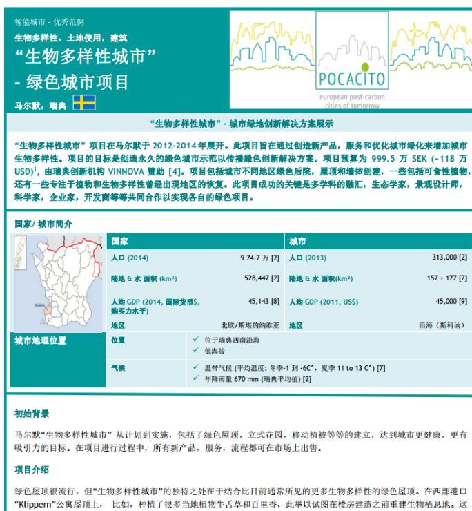
Figure 1 Factsheet in Chinese