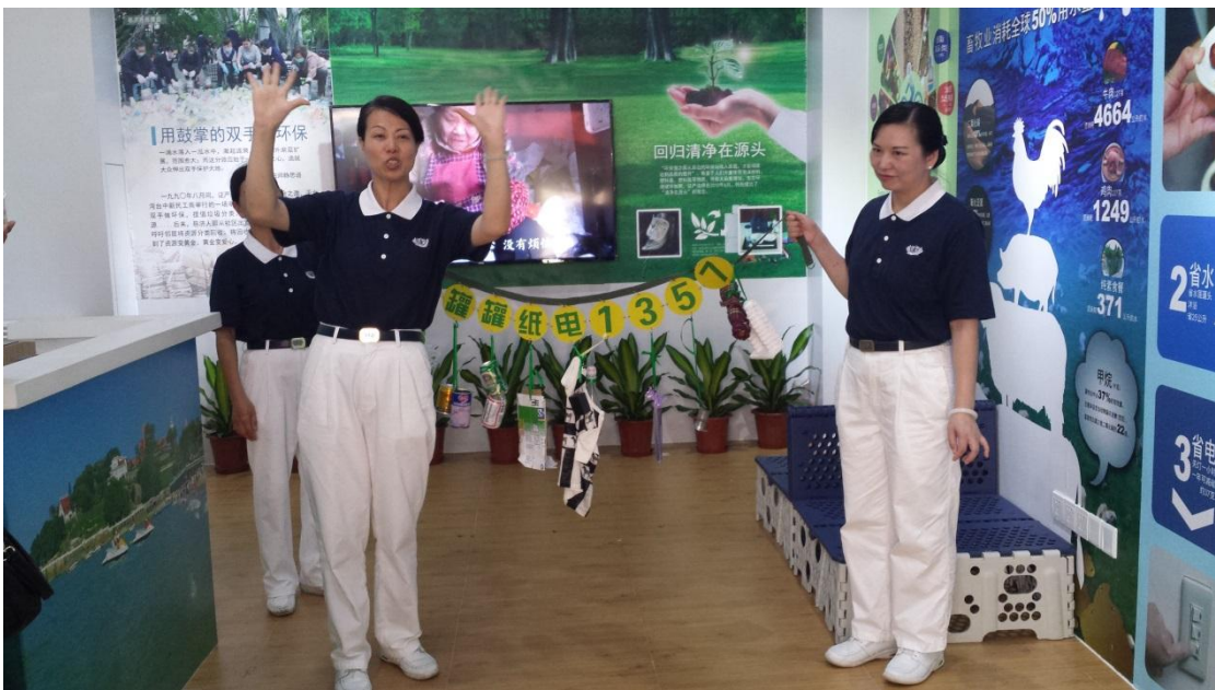
(4) Volunteers from Ciji Green Room introduce principles of low-carbon life.