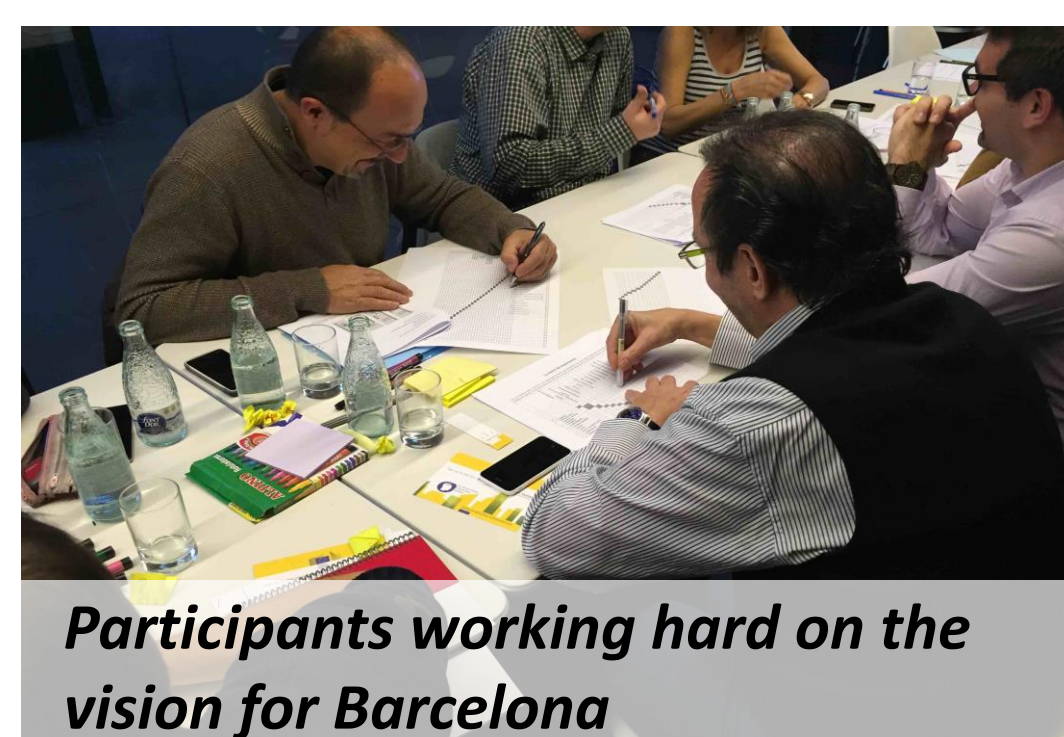
Participants working hard on the vision for Barcelona

Key overarching messages from the workshops