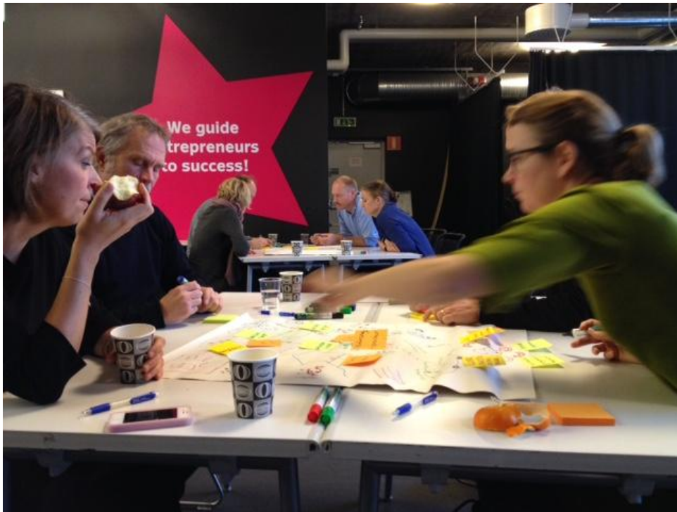
Figure 17: The groups busy working on the visions

City gardening and farming in all forms is a common activity that encourages individuals, areas and the entire city!