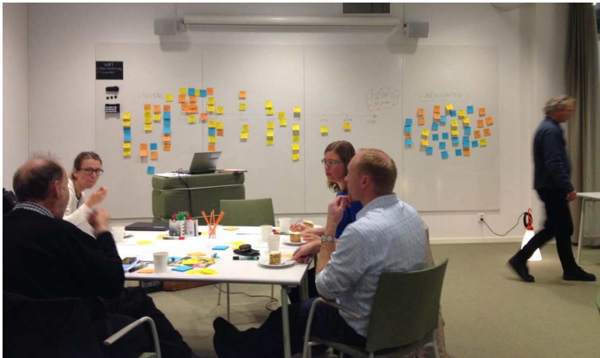
Figure 18: Back casting workshop.