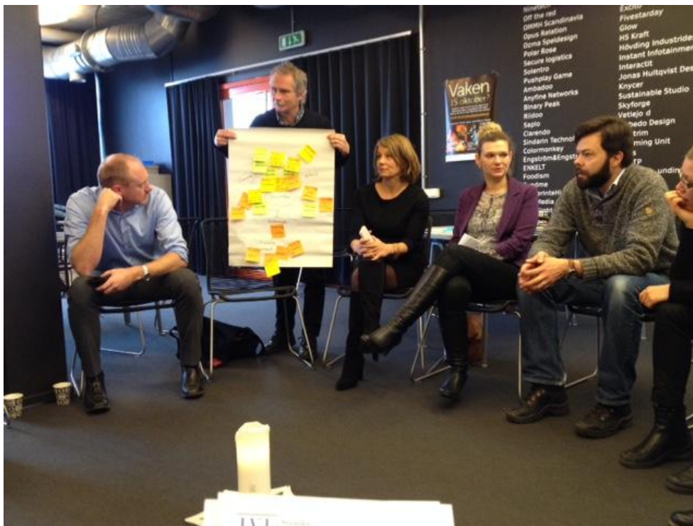
Figure 16: Presentation of visions in plenum.